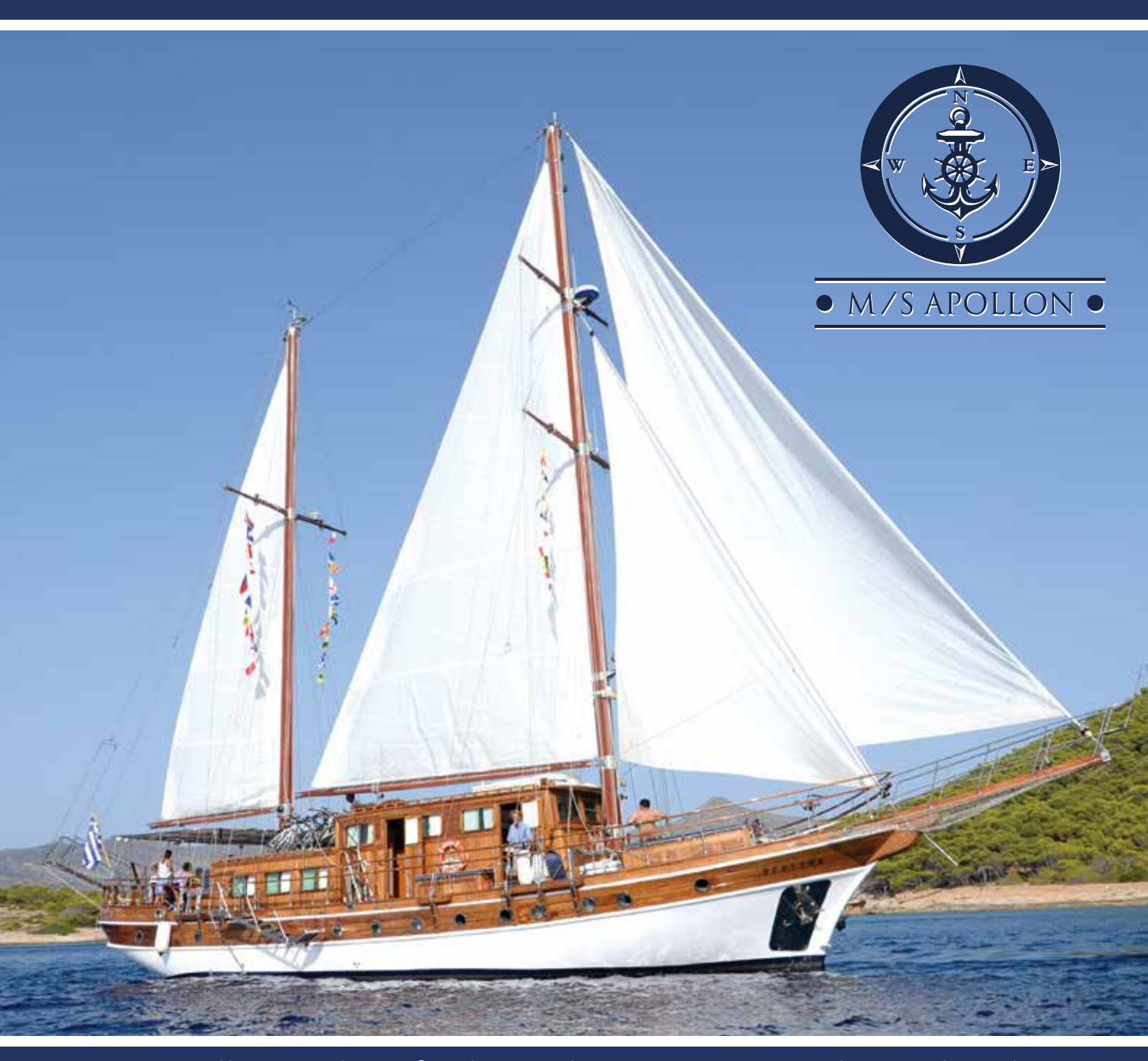
a wholly hand crafted wooden yacht in traditional style